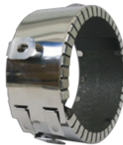
◀ ESHCOLLAR™ V60