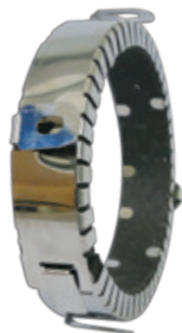
◀ ESHCOLLAR™ V30